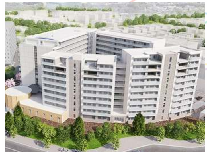
Osaka University International House, Toyonaka