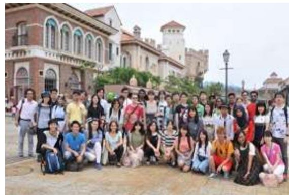
Bus Trip to Wakayama