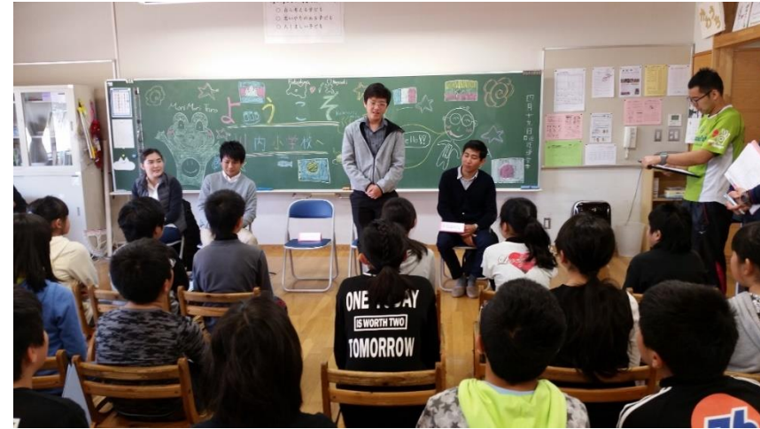
Communication with elementary school children