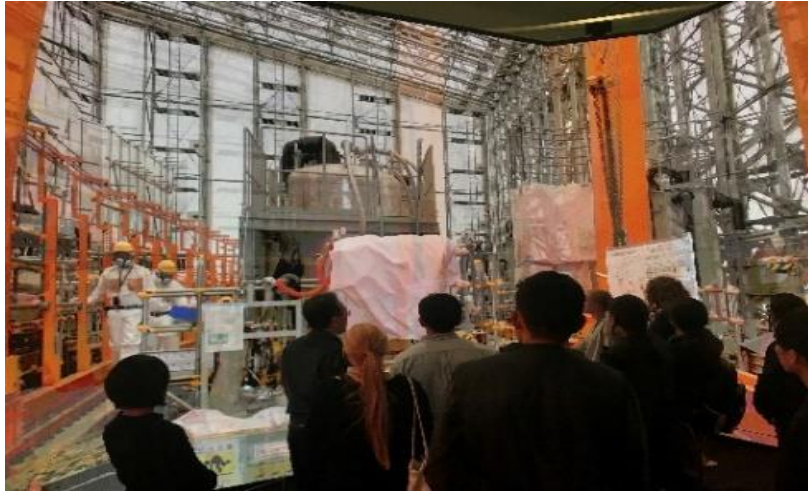
Visit to the Decommissioning Museum