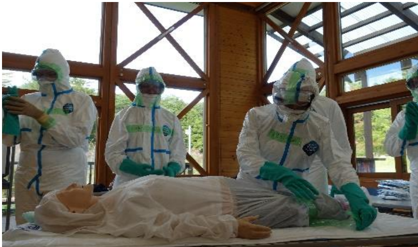
Emergency medicine training